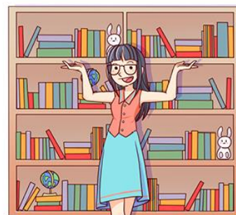
The school redeems Scholastic Rewards for additional resources