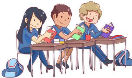
The school earns Scholastic Rewards.