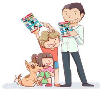
Families order from Book Club.

Every purchase you make earns your child's school 15% of your order value in Scholastic Rewards that can be used to purchase valuable educational resources that benefit your child.