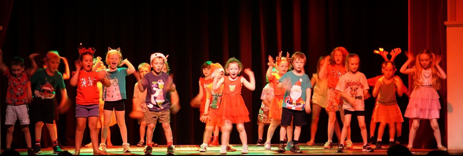
A few pics from our School Concert - huge thanks to Sylv Tyrer for these photos!