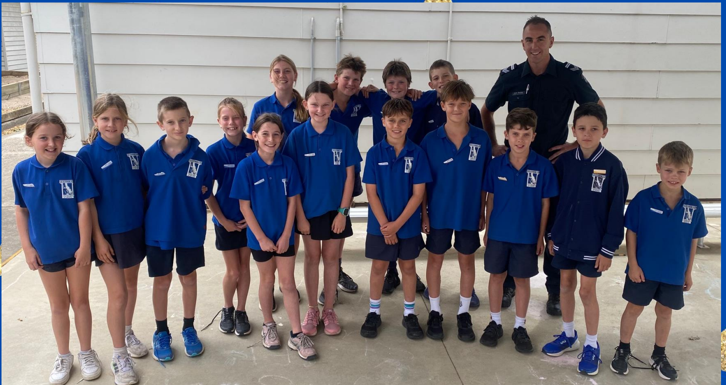
2024 School Leaders